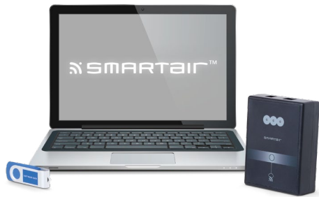
PC, software and card encoder